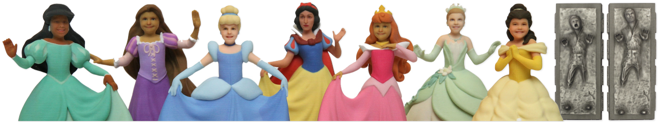
Figure 1: Example figurines fabricated by our system. The face and skin texture are customised to each individual. A range of character types are available and the system is easily expandable to new characters.